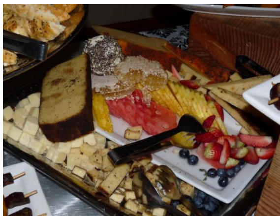
An appetizer tray at the dinner. Food was provided by Beehive Cheese.