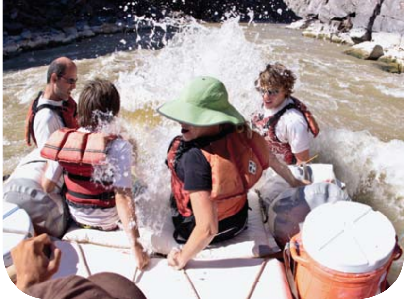
Hang on tight! Here comes Skull!

Our day had begun at over 8,100 feet in elevation, naturally a bit chilly. We ended on the banks on the Colorado River at around 4100 feet and considerably warmer, mid-summer hot. To cool off, the three boys in the group ran down to the river and jumped in, followed shortly by the rest of the group. It felt so refreshing after another full day on the bike. Following diner we sat together, reminiscing about the past two days, as a mid-summer lightening storm lit up the sky off the distant peaks of the La Sal's. Mesmerized by the kaleidoscopic lightening storm, we failed to notice the full moon rising over the high cliffs behind us until someone shouted to turn and witness the last bits of the moon peering over the cliff walls. The night was suddenly very bright with nature's lamps -