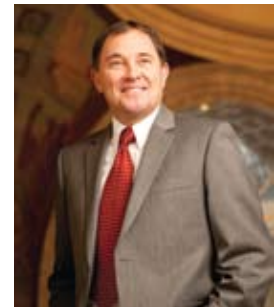
Gary R. Herbert Governor

The Utah Office of Tourism is pleased to partner with Outdoor Utah in promoting recreational tourism in the state.