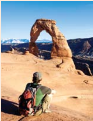
On the cover Delicate Arch